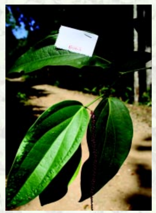
P. sugandhi a close relative of P. nigrum

subgroup in the phylogenetic classification. Variation in the inter-microsatellite regions among cultivars was found to be low.