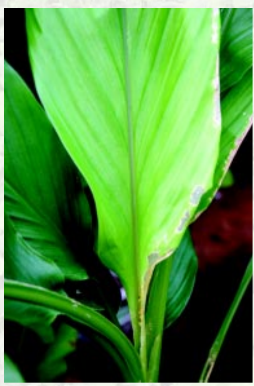
Early symptom of shoot borer larvae infestation on tender leaf of turmeric

todes were observed throughout the crop season and the percentage of population of larvae parasitised by the nematode was higher during August and September.