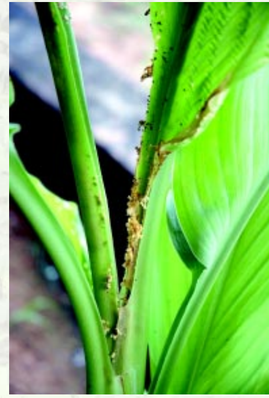
Symptom of entry of shoot borer larvae into central shoot of turmeric through leaf petiole

A highly significant positive correlation of leaf P/Zn ratio and a significant negative correlation of soil P/Zn ratio with rhizome yield of ginger were observed. Step wise regression analysis showed that leaf P/Zn is most influencing factor on rhizome yield followed by soil P/Zn ( r2=0.353^{**} ). The critical range of leaf P/Zn ratio was found to be 27.9 to 90 through Mitscherlich model.