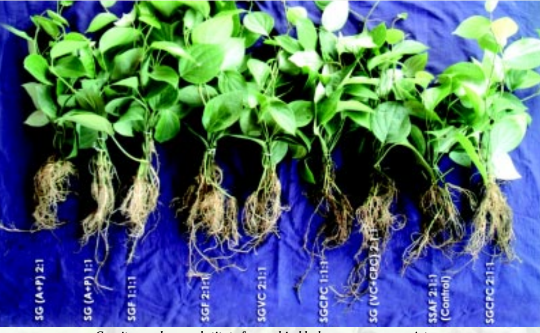
Granite powder- a substitute for sand in black pepper nursery mixture

The berries belonging to five varieties of black pepper were graded to 4 sizes i.e. <3.5mm, 3.5 to 3.8mm, 3.8 to 4.8mm and